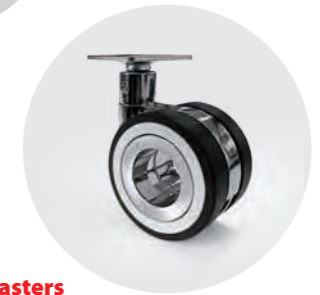
Table with Casters

this tables can be fitted with optional casters or one set fits nicely on the designated transport trolley