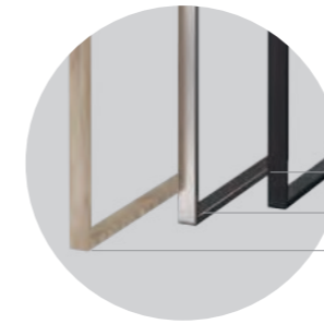
Table Leg Options

Storage space saving – as they are designed to stay in your foyer or lobby; when not in use for events they make great displays